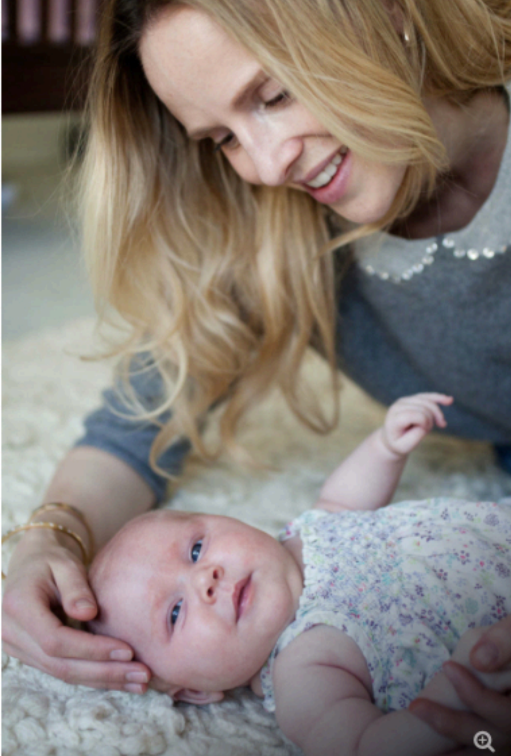
f t g+ p