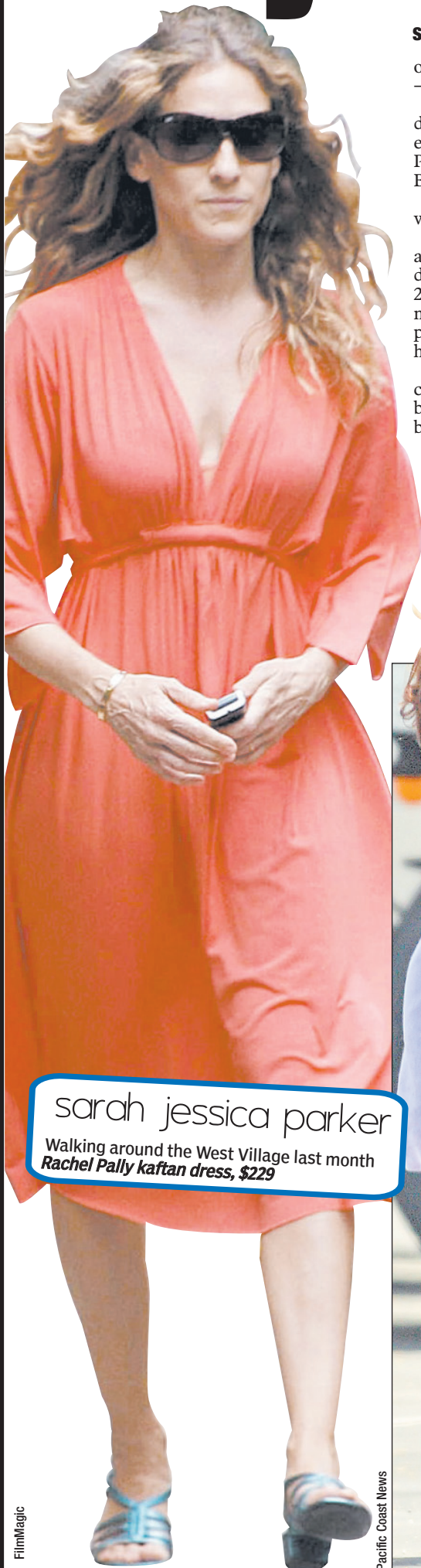
sarah jessica parker

Most items pictured here are available at nessaleestyle.com ; prices are estimates.